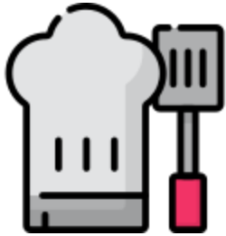
Cooking & Baking